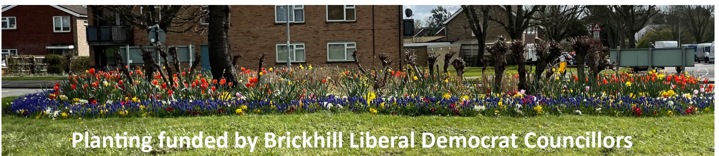
Planting funded by Brickhill Liberal Democrat Councillors

Since alerting residents to the difficulties involved in preventing the parking of commercial vehicles on residential roads we have received numerous requests for help from residents who suffer from parking problems. We have been pleased to offer advice wherever possible and will continue to do so if our residents are suffering from these difficulties.