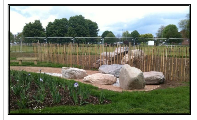
Play Area under construction in May

Brickhill has a new natural play area on Waveney Green designed especially for children aged 8 – 13 yrs. The site and the equipment were chosen after consultation with the community of Brickhill. The area has been funded using money from the Government's Playbuilder Scheme and is intended to encourage children to enjoy imaginative, challenging and stimulating play.