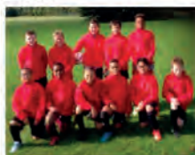
The Year 5 Football Team

Scott Primary is proud to offer a variety of creative and sporting clubs for both KS1 and KS2 children which take place in the mornings, at lunch time and after school. From Cooking, Sign Language and Theatretrain to Football, Bug Club and Netball. The children show superb sportsmanship in their efforts when competing in fixtures against other schools and are wonderful ambassadors for the school.