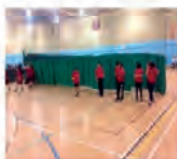
KS2 District Dodgeball

Scott Primary School had a very special visitor to school on Monday 13th November. Pudsey bear surprised the children in an assembly and handed out certificates to the winners of our Children in Need colouring competition. The school also held a 'Spotty' themed multi day and cake sale to raise money for the Big BBC Children in Need Spotacular. Scott Primary is actively involved in fundraising to support good causes.